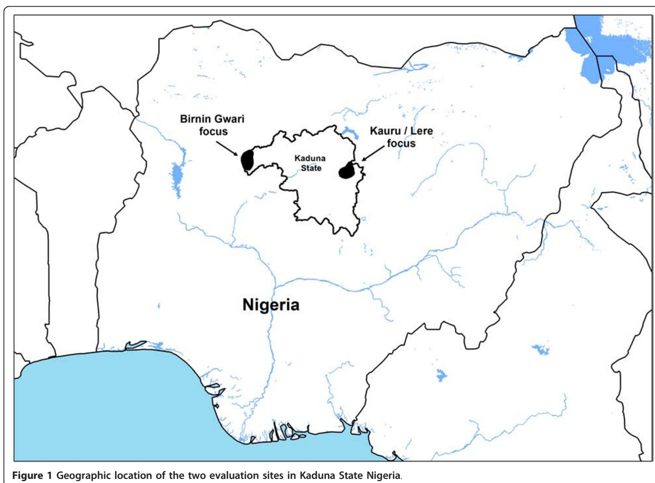
Figure 1 Geographic location of the two evaluation sites in Kaduna State Nigeria.

are located along the rivers of Mairiga and Kwingi in Birnin Gwari and Galma and Karami in Kauru and Lere. The two foci were selected for the following reasons: i) communities in these foci had pre-control epidemiological data; among the areas where large-scale ivermectin treatment was first introduced in Africa were these two foci in Kaduna in which treatment of a sample of the population started as part of a randomised controlled trial of ivermectin in 1988 and 1989, and where skin-snip surveys had been done in preparation for the trial [6,17]. ii) the foci included hyper-endemic villages, i.e. villages with a prevalence of microfilaridermia > 60% [15-17]; iii) the area was located along a river with known breeding sites of Simulium damnosum s.l. , iv) the communities had had 15 - 17 years of annual treatment with ivermectin using the community-based programme since 1991, and subsequently through the community-directed treatment with ivermectin (CDTI) strategy from 1997 with more than 65% treatment coverage.