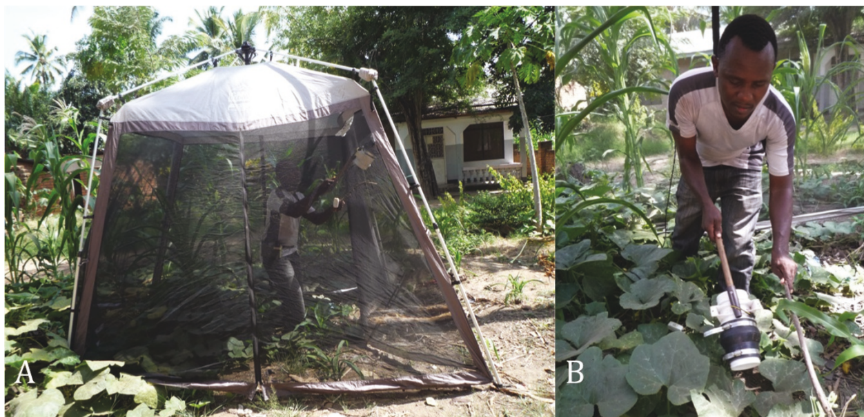
Figure 3 Drop-net. A - Field technician aspirating mosquitoes that landed on the walls of the drop-net with a Prokopack aspirator. B - Field technician beating slightly the vegetation to disturb the resting mosquitoes and aspirating them using a Prokopack aspirator.

The interaction between collector and aspirator were analysed to determine which aspirator type is capable of delivering most consistent results, despite individual variability in collection ability. Data was fitted to a generalized linear model. In this analysis an interaction