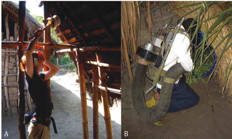
Figure 1 Prokopack and CDC backpack aspirator. A - Collector using the Prokopack aspirator to sample mosquitoes from underneath the roof of a kibanda . B - Collector using the CDC backpack aspirator to sample mosquitoes from inside a barrel.