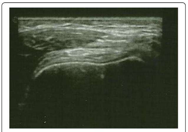
Figure 4 Case 1 left knee ultrasound after treatment. Left knee: transverse gray-scale 12–5 MHz ultrasound image obtained over the medial aspect of the knee showing normal aspect of the joint without fluid or synovial pannus into the subquadriceps recess.