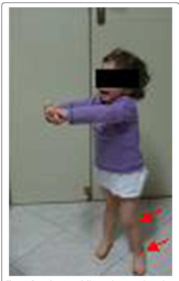
Figure 3 Case 1 (age 2 years). Photograph patient with juvenile idiopathic arthritis with fixed flexion contraction of the left leg for active knee and ankle joints arthritis (red arrows).

A boy aged 9 years and 4 months was admitted to hospital in June 2012 with oligo-articular extended-onset JIA and associated chronic bilateral uveitis with posterior synechiae. Immune serology was positive for antinuclear antibodies (ANA) and human lymphocyte antigen (HLA) B27, while rheumatoid factor (RF) was negative. Age at disease onset was 1 year 9 months, when the patient presented with bilateral anterior uveitis with eyes redness and headache, diagnosed with slit-lamp that showed cells in the anterior chamber. He was treated with steroid eye drops and mydriatics. At the same time, he presented arthritis of the left ankle, progressing into oligoarticular extended form with arthritis of the knees, left elbow, left shoulder, left wrist and the small joints of the hands and feet. The patient was treated with injections of triamcinolone hexacetonide1 mg/kg into the left ankle and both knees.