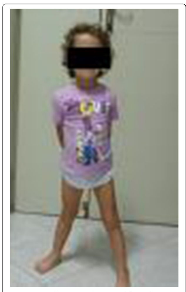
Figure 6 Case 1 after 2 years of ongoing adalimumab treatment. Photograph showing patient in remission at 4 years of age.

A 5-year-old girl was referred in August 2008 for management of arthritis. The patient had severe swelling and limited range of motion in the right ankle, slight swelling and slight effusion in the right knee with full range of motion, and slight swelling of the right wrist and the fourth metacarpo-phalangeal joint of the left hand. Physical examination was otherwise unremarkable. Laboratory tests showed high ESR (64 mm/h) and ANA positivity, with a titer of 1:640 and homogeneous pattern. Though in the absence of ocular symptoms, eye evaluation with slitlamp examination was positive for signs of iridociclitis, showing cells in the anterior chamber with initial band