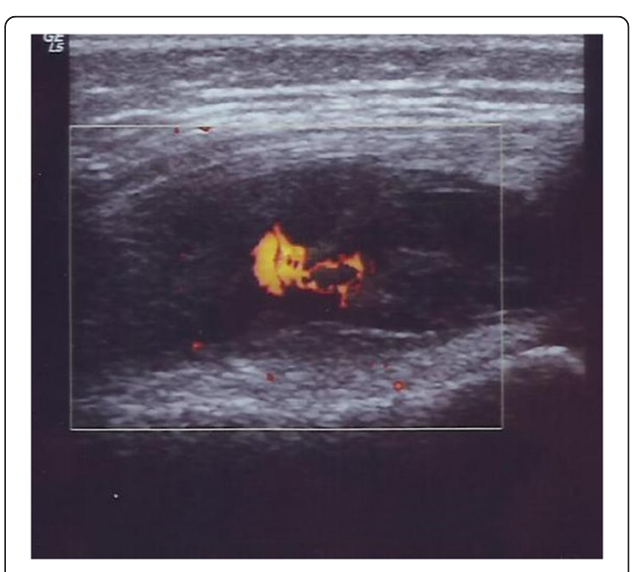
Figure 1 Case 1 left knee ultrasound. Transverse gray-scale and color Doppler 12–5 MHz ultrasound image obtained over the medial aspect of the knee showing abundant synovial pannus filling the subquadriceps recess as a band of hypoechoic tissue intermingled with fluid. Marked synovial hyperemia is observed at color Doppler examination indicating active pannus.

The patient was started on treatment with adalimumab 24 \text{ mg/m}^2 every 2 weeks in combination with prednisone