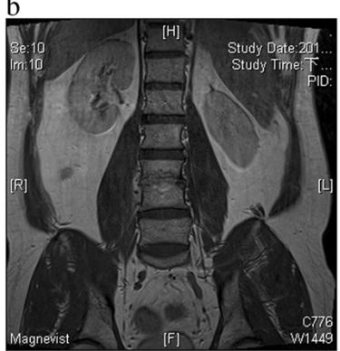
Figure 2 Magnetic resonance imaging showed significant shrinkage of the vertebral osteomyelitis, discitis, and paraspinal abscesses. (a and b) Magnetic resonance imaging (MRI) showed significant shrinkage of the vertebral osteomyelitis, discitis, and paraspinal abscesses, although there were still abnormal signals and enhanced lesions in the disc adjacent to the affected vertebral bodies.

weight loss are non-specific. Similarly, anemia, neutrophilia, and elevated ESR are also non-specific, representing a chronic inflammatory process, although a markedly elevated ESR is suspicious of infection.