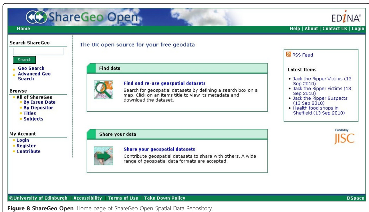
Figure 8 ShareGeo Open. Home page of ShareGeo Open Spatial Data Repository.

Metadata Workshops are offered as part of an effort to change the mindset and culture of the academic community. The workshops provide an overview of metadata, standards, portals, and stress the importance of