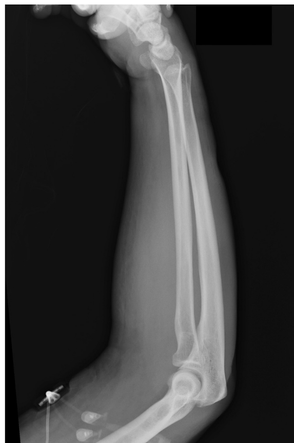
Figure 5 Lateral view of the right arm taken eight days after initial presentation demonstrating resolution of subcutaneous free air.

Subcutaneous emphysema has many causes ranging from the benign and non-infectious to severe necrotizing infections. In evaluating patients with subcutaneous emphysema a wide differential diagnosis is required to appropriately identify and treat the cause. Non-infectious causes of subcutaneous emphysema include trauma, perforation of the pulmonary or digestive system, blast injuries, air gun injuries, high pressure injection injuries, factitious injection of air, cutaneous ulcers, elbow arthroscopy, dental extraction, and iatrogenic use of hydrogen peroxide [1-5]. One case report highlights an episode of benign subcutaneous emphysema of the upper extremity without fractures or a pneumothorax, while another reports on self-induced lower extremity