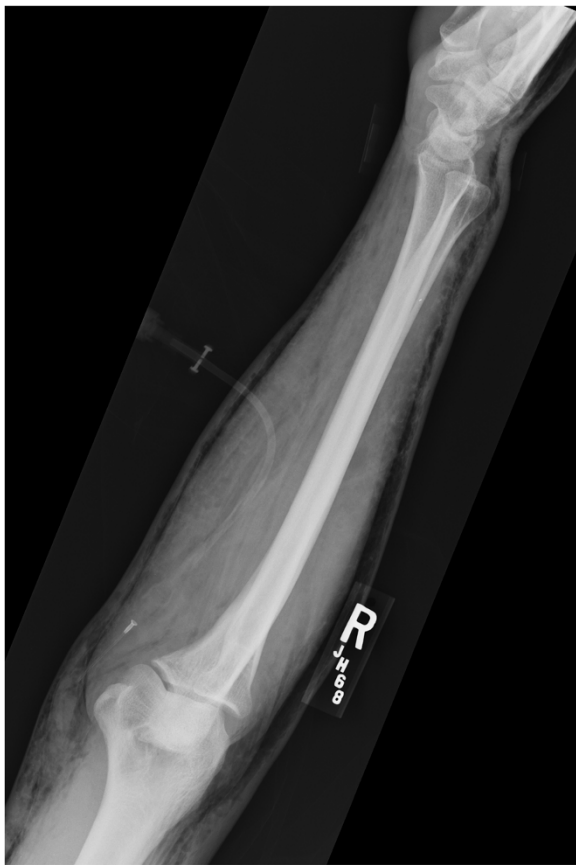
Figure 2 Lateral view of the right arm taken in the emergency department demonstrating significant subcutaneous free air.

upper extremities, chest, abdomen and scrotum. No air tracked along the deep fascial planes and there was no intramuscular air.