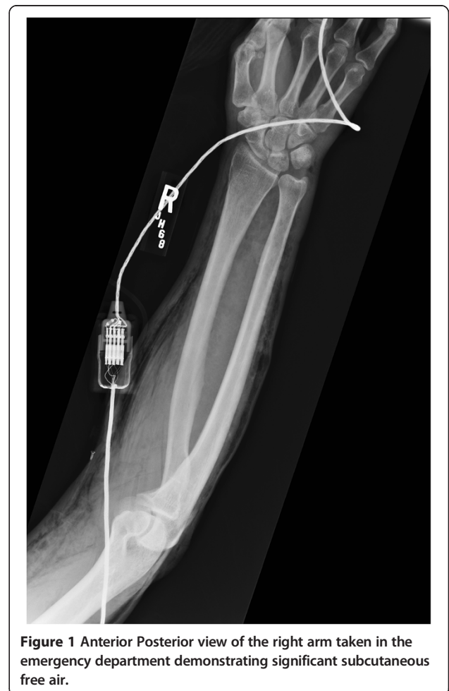
Figure 1 Anterior Posterior view of the right arm taken in the emergency department demonstrating significant subcutaneous free air.

Laboratory values on admission included an elevated white blood cell count (WBC) of 18.4, C-reactive protein (CRP) elevated to greater than 150 mg/L, creatine elevated to 4.9 mg/dL (433 μmol/L), a blood glucose of 119 mg/dL (6.6 mmol/L), a serum sodium of 125 and a hemoglobin of 11.9. Plain radiographs and computerized tomography (CT) scans demonstrated a mandible fracture, multiple rib fractures with a pneumothorax, left small and ring finger amputations through the proximal phalanx, right great toe with a foreign body, and extensive subcutaneous emphysema throughout the bilateral