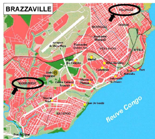
Figure 1 Brazzaville map, Republic of Congo, 2004.

A total of 1115 persons were admitted to the MSF program between January 1, 2002 and April 30, 2003. Among them, 178 patients met the following criteria: 1) Women aged more than 15 years; 2) raped by an unknown person(s) wearing military clothes; 3) admitted to the MSF program between the 1/1/2002 and the 30/4/2003; and 4) and living in Brazzaville. Among these 178 women meeting the inclusion criteria, 19 refused psychological