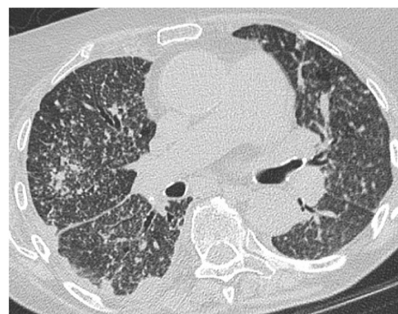
Figure 1 High-resolution computed tomography showing mildly enlarged lymph nodes, mostly right-sided pleural lesions, thickening of the fissures and interlobular septa, and bilateral diffuse micronodular opacities (miliary pattern).

Urgent bronchoscopy with bronchoalveolar lavage (BAL) led to further respiratory distress for our patient, necessitating intensive care unit (ICU) admission. Piperacillin-tazobactam was empirically started and the BAL results showed Pseudomonas aeruginosa , susceptible to the initiated antibiotics. Acid-fast stains were repeatedly negative (BAL and sputum). Four days later, one blood culture turned positive for Nocardia species. Her antibiotics were switched to trimethoprim-sulfamethoxazole combined with piperacillin-tazobactam. Intubation and mechanical ventilation proved necessary because of further respiratory