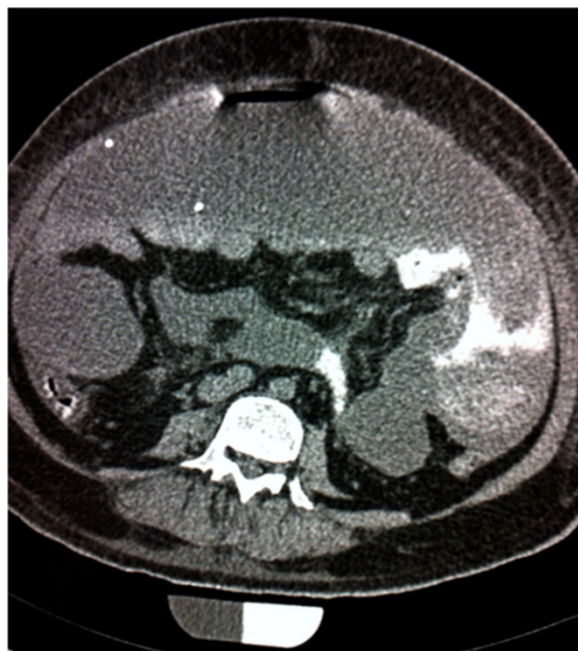
Figure 3 Emergent axial computed tomography scan of the abdomen with contrast enhancement showing extravasation of contrast from the proximal small bowel, indicating bowel perforation.

well as profound jaundice and encephalopathy, indicative of end-stage hepatic failure. Despite aggressive anti-coagulation therapy being administered continuously throughout the patient's admission, and in spite of his vitamin B 12 and homocysteine levels turning normal, his thromboses did not resolve. This resulted in splenic infarction as well as progressive liver failure with severe hepatic encephalopathy. The patient eventually died due to hepatic failure three months into his hospital stay.