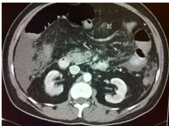
Figure 1 Axial computed tomography scan of the patient's abdomen with contrast enhancement showing portal vein thrombosis causing complete occlusion of the lumen of the portal vein.

Genetic testing for factor V Leiden mutation and JAK2 gene mutation was negative. Immunoglobulin G (IgG) and IgM assays for anti-cardiolipin and anti-β 2 -glycoprotein