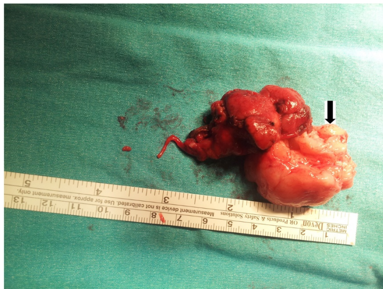
Figure 2 View of the tumor specimen with submandibular gland (black arrow).

Schwannoma, first described in 1908 by Verocay, commonly occurs between 30 and 50 years old [6]; however,