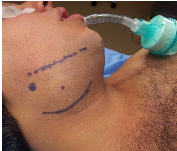
Figure 1 A 19-year-old man presented with a mass on his right lateral submandibular region.

excised with the submandibular gland and the surgical defect was closed. Macroscopically, the resected mass was encapsulated, yellowish in color, measuring 6cm in its greatest diameter. It was oval, smooth and firm (Figure 2). Our patient had an uneventful postoperative recovery. Total excision resulted in complete resolution of symptoms with no cranial nerve deficits.