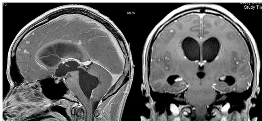
Figure 2 Preoperative contrast-enhanced magnetic resonance imaging showed millet seed-like enhancement along the third ventricular wall, multiple small enhanced lesions along the Virchow-Robin spaces, and abnormal enhancement near the foramen of Magendie.

negative. A chest X-ray showed bilateral lymphadenopathy with normal lung parenchyma. Computed tomography (CT) showed extensive mediastinal, hilar, and paratracheal lymphadenopathy. A CT of his head showed remarkable hydrocephalus with dilatation of all the ventricles, particularly the fourth, but it did not reveal the etiology (Figure 1). Chiari-type I malformation was excluded on magnetic resonance (MR) imaging. Cine-MR imaging showed good patency of the cerebral aqueduct and absence of a CSF flow signal in the area of the cisterna magna. Gadolinium-enhanced T1-weighted imaging showed millet seed-like leptomeningeal enhancement and multiple small enhancing lesions along the Virchow Robin spaces (Figure 2). Abnormal enhancement was also observed around the fourth ventricular outlet. These findings strongly suggested a chronic inflammatory disease such as neurosarcoidosis. The findings of gallium scintigraphy supported a