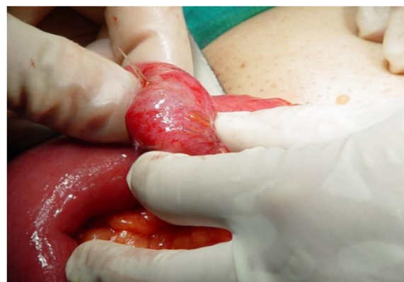
Figure 2 A view of the fish bone that perforated the Meckel's diverticulum.

Bleeding is the most common presentation in children, representing 50% of Meckel's diverticulum-related complications among patients younger than 18 years of age. Intestinal obstruction is the most common presentation in adults with Meckel's diverticula. Diverticulitis, present in 20% of patients with symptomatic Meckel's diverticula, is associated with a clinical syndrome that is indistinguishable from acute appendicitis [1,3].