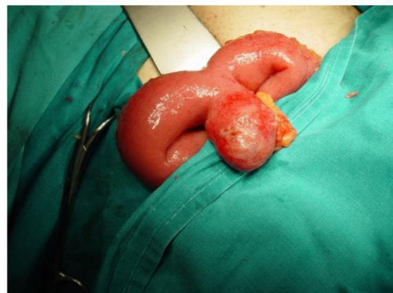
Figure 1 Meckel's diverticulum perforated by a fish bone as it was found during surgery.

Meckel's diverticulum is a congenital, intestinal blind pouch that results from an incomplete obliteration of the vitelline duct during the fifth week of gestation. Wilhelm Fabricius Hildanus, a German surgeon, first described the diverticulum in 1598. However, the entity