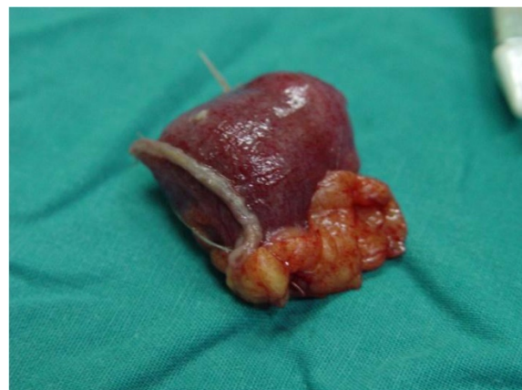
Figure 5 The anatomical specimen after excision.

Meckel's diverticulum is notoriously difficult to diagnose both clinically and radiologically as the symptoms and imaging features are non-specific. The utility of Tc-99m pertechnetate scintigraphy in the diagnosis of ectopic gastric mucosa is well established, particularly in the case of Meckel's diverticulum, despite substantial variation in the reported sensitivity. Radiological as well as clinical findings aid clinicians in diagnosing this congenital anomaly [5].