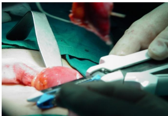
Figure 3 Excising the Meckel's diverticulum using a GIA 55mm.