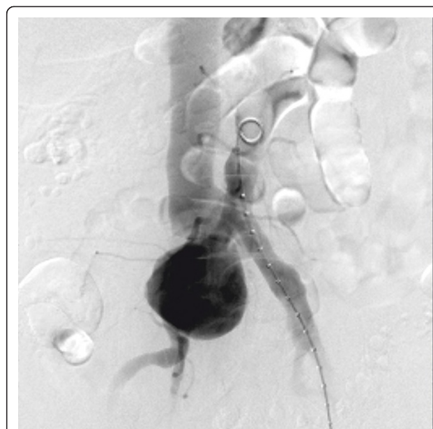
Figure 1 Aortogram demonstrating a large right common iliac artery aneurysm with simultaneous contrast opacification of his inferior vena cava.

Access into his right CCA was then achieved with a Cook Shuttle sheath (Bloomington, IN, USA). Carotid angiography demonstrated the catheter entry point into his mid-right CCA (Figure 2). The catheter was removed and angiography revealed a carotid-to-jugular arteriovenous (AV) fistula (Figure 3). An 8 mm \times 40 mm Abbott FoxCross (Abbott Park, IL, USA) angioplasty balloon was positioned distal to the carotid bifurcation and inflated for three minutes. Angiography then