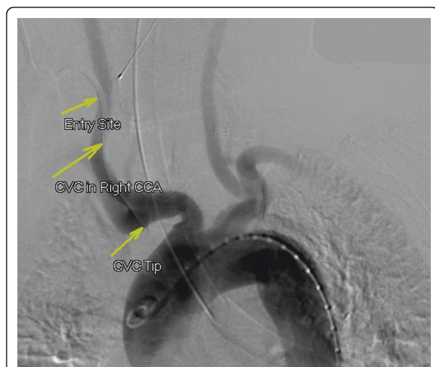
Figure 2 Arch aortogram demonstrating the right-sided central venous catheter entry site into his right common carotid artery and the tip in his innominate artery.