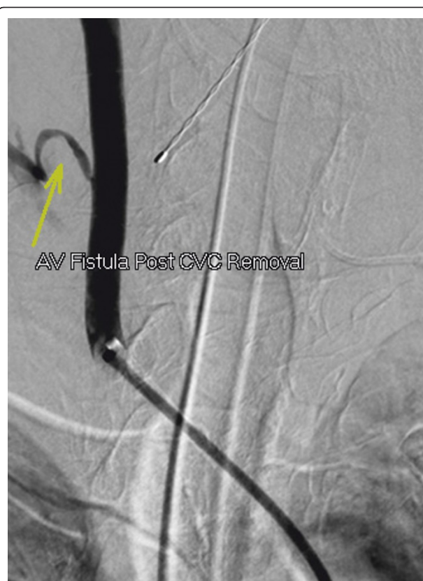
Figure 3 Selective right carotid angiogram after removal of the central venous catheter, demonstrating contrast extravasation in his neck and opacification into his internal jugular vein.

demonstrated a persistent fistula. The balloon was re-inflated for five minutes. Subsequent angiography revealed a widely patent carotid artery with no AV fistula or contrast extravasation visible (Figure 4).