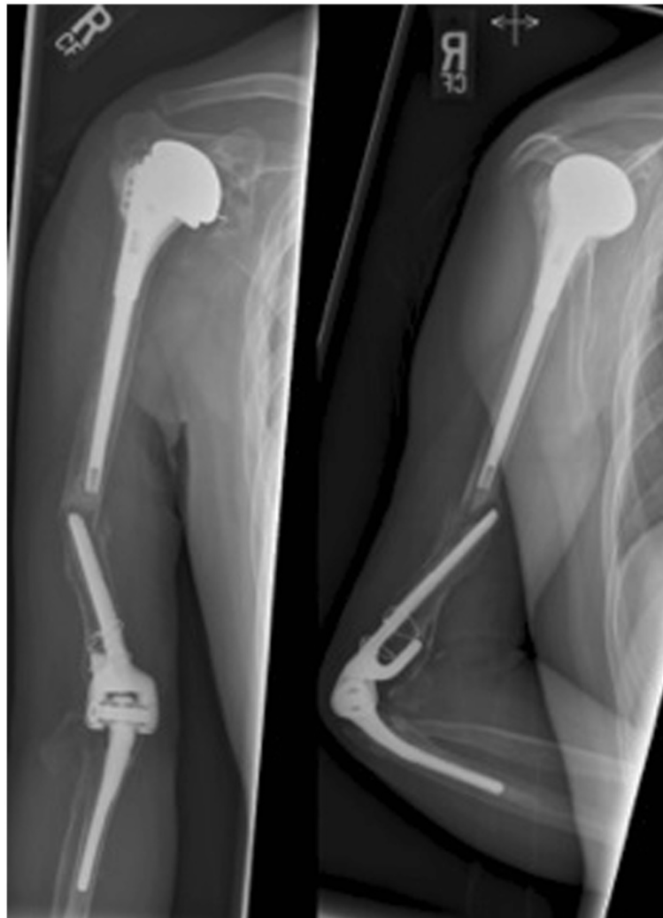
Figure 2 Patient presents with an interprosthetic fracture.

allograft followed by preparation of the canal. A high-speed burr was used to prepare the proximal extent of the allograft to barrel-stave the allograft over the humerus itself. The distal tibial allograft segment was then osteotomized to leave the appropriate length of the humerus distally. A small size humeral component was used to match the ulnar component. The tibia allograft was prepared using the appropriate broaches. Rotation of the tibia allograft was confirmed and the trial component was inserted, followed by reduction of the elbow prosthesis. Near full extension was achieved and flexion beyond 130°. After cleaning the canal, the allograft was retrograde filled with commercially available cement containing gentamicin. The allograft was barrel-staved onto his humerus first. The cement was then placed into the allograft followed by positioning of the implant into the allograft. A small size distal humerus component was then cemented into place. Care was taken to ensure