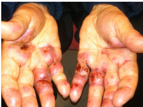
Figure 2 Painful, palpable rash with hemorrhagic bullae of hands.

Six months later, he presented again with a right-sided pleural effusion that contained atypical mesothelial cells on drainage, raising the suspicion of MPM. A subsequent video-assisted thoracoscopic surgery biopsy confirmed biphasic MPM involving the parietal pleura. Laboratory tests demonstrated thrombocytosis of 628 \times 10^9 cells/L (normal range: 150 \times 10^9 cells/L to 400 \times