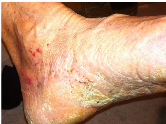
Figure 1 Multiple erythematous, papular and non-blanching rash on lower legs.