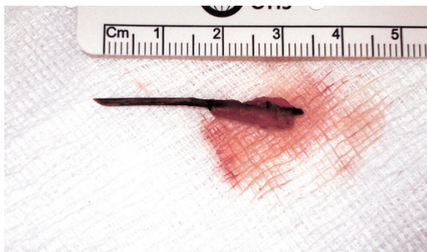
Figure 2 The toothpick after laparoscopic extraction.

Foreign body ingestion is a common event which may happen accidentally or intentionally [1]. Many such ingested foreign bodies pass through the gastrointestinal tract uneventfully [5]. However, in the case of sharp objects such as toothpicks, serious complications can be unavoidable. Ingested toothpicks tend to stick in places where there is natural narrowing, sharp angulations, or congenital gastrointestinal malformation [6]. Li et al. in his systemic review of 57 cases found that the duodenum and sigmoid colon are the commonest sites for perforation. Patients diagnosed with perforation of the gastrointestinal tract due to toothpick ingestion are usually men (88%) who present with abdominal pain (70%) or gastrointestinal bleeding (7%). Only 12% of patients had any recollection of swallowing a toothpick. In patients who remembered the event, the onset of symptoms ranged from less than a day to 15 years. The duration of symptoms before diagnosis ranged from one day to nine months [2]. Toothpick ingestion may cause severe, sometimes fatal, internal injuries due to gastrointestinal