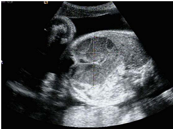
Figure 1 Ultrasound image: 32.3 weeks of gestation. Transverse scan image through the fetal abdomen identifying a mass occupying the entire left hemiabdomen (meconium pseudocyst), with mixed echogenicity. No calcifications were observed.

umbilical artery and normal middle cerebral artery Doppler studies. The second fetus (transverse situation) had no apparent pathology and normal Doppler studies. Previous ultrasound examinations of both fetuses before 32 weeks were normal.