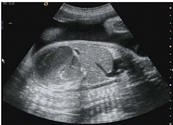
Figure 2 Ultrasound image: 32.3 weeks of gestation. Longitudinal scan image through the fetal abdomen identifying a mass occupying the entire left hemiabdomen (meconium pseudocyst), with mixed echogenicity. No calcifications were observed.

At 32.6 weeks of gestation, uterine contractions and cervical ripening began. Urgent cesarean section was