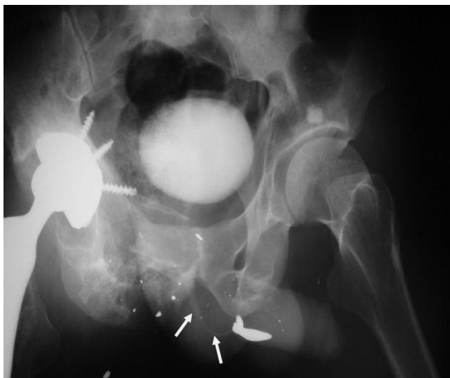
Figure 4 Left oblique post voiding urethrography of the patient faintly showing patent posterior urethral lumen (arrows).

Normally, the urethra may develop an abnormal communication with the bladder, rectum, perineum or genital