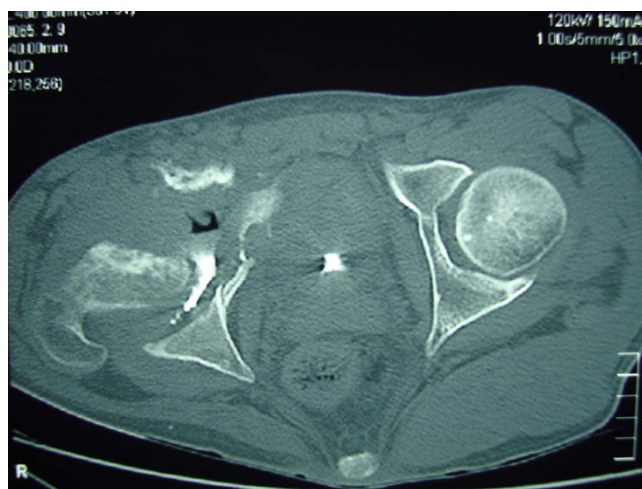
Figure 2 Axial computed tomography scan of the right acetabular cavity following retrograde urethrography showing destruction of the acetabular cavity and femoral head. Air-fluid level and contrast media accumulated around the femoral head.

located by placing a Van Buren sound and semicircular sound in the anterior and posterior urethra via the cystostomy tract, respectively. The stricture length was approximately 5 cm. Stricturectomy was performed and the edges were sutured to a graft from a bladder mucosa. An intraluminal catheter was placed to serve as a stent and a suprapubic cystostomy was done to divert the urine.