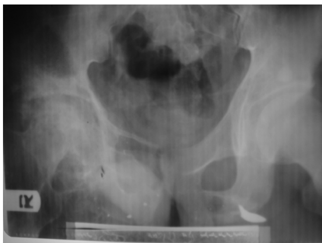
Figure 1 Plain X-ray of the right hip joint showing destruction of the joint cavity and femoral head.