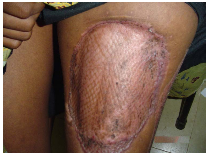
Figure 3 Healed grafted area at 5 months, with no evidence of recurrence.

This patient presented with a solitary giant PG on a skin graft donor site, and was found to be HIV positive, an unusual combination, as most HIV-related PGs reported in literature present as multiple lesions, and on staining