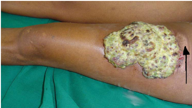
Figure 1 Giant pyogenic granuloma, left thigh. Note (arrow) normally healed skin graft donor site on the proximal edge of the mass.

had a healed scar on her leg, and was otherwise in good health.