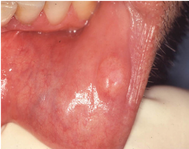
Figure 1 Clinical appearance of fibrolipoma. This lesion usually presents as an asymptomatic swelling of soft consistency, mobile on the surrounding tissues.

admixture of mature adipose tissue, including variably sized typical adipocytes, embedded within dense collagen fibres (Fig. 3), consistent with fibrolipoma. Regressive changes of the tissues located at the surgical margins, such as cellular hyperbasophilia, nuclear chromatin condensations or tissue coarctation were not detected.