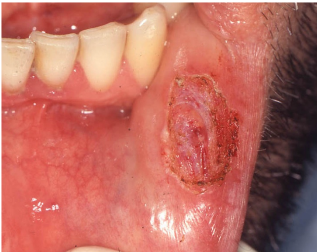
Figure 2 Clinical appearance of the surgical scar 10 days after surgery. The use of a diode laser with a 300 \mu\text{m} fibre and operating at 2,5 W allowed prompt recovery of the patient, with no inaeesthetic alterations of the adjacent tissues.

admixture of mature adipose tissue, including variably sized typical adipocytes, embedded within dense collagen fibres (Fig. 3), consistent with fibrolipoma. Regressive changes of the tissues located at the surgical margins, such as cellular hyperbasophilia, nuclear chromatin condensations or tissue coarctation were not detected.