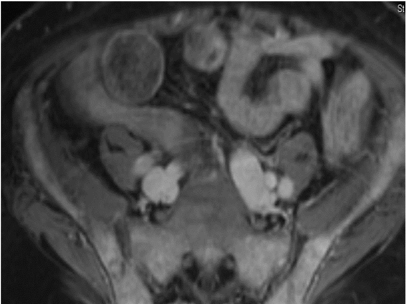
Figure 1 MRI pelvis. Diffuse bone marrow replacement throughout the pelvis and proximal femora with only small areas of residual fatty marrow in the greater trochanters and femoral heads bilaterally. The diffuse enhancement is consistent with extensive disease.

plaints of fatigue and lower extremity edema. On examination, he was afebrile with a heart rate of 75 beats/minute and a blood pressure of 127/70 mmHg. His oxygen saturation was 97% on room air. He had faint crackles at the bases of his lungs bilaterally. His cardiovascular exam was remarkable for 10 cm of jugular venous distension, a regular rhythm, and a 2/6 systolic flow murmur at the left upper sternal border. His abdominal examination was benign. His extremities were warm to touch with 2+ bilateral lower extremity edema. Pertinent laboratory studies were remarkable for a hemoglobin of 9.1 g/dl, a platelet count of 105,000 per microliter, a blood urea nitrogen of 13 mg/dl, a creatinine of 1.0 mg/dl, an albumin of 3.9 g/dl, and a calcium of 9.2 mg/dl. His ECG demonstrated normal sinus rhythm, normal voltage and left atrial enlargement. An echocardiogram with Doppler conveyed hyperdynamic left ventricular function with an ejection