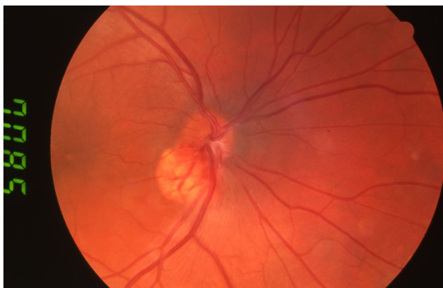
Figure 1 Fundal Photo – Two years after presentation showing an exophytic haemangioblastoma adjacent to the right optic nerve head.