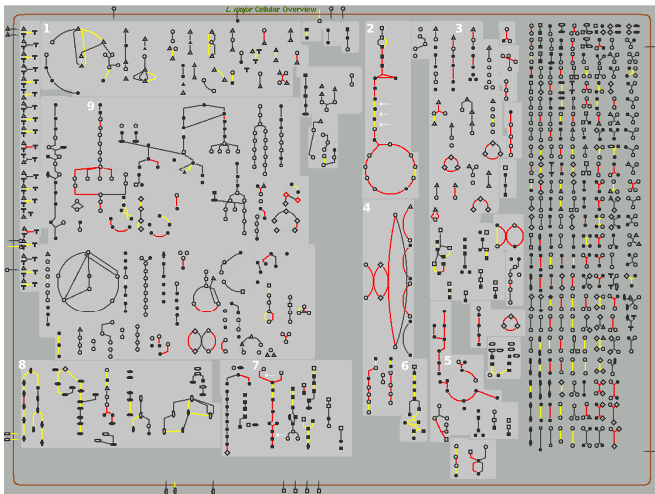
Figure 2 Overlay of proteomic data sets using the LeishCyc Omics Viewer. Changes in the proteome of L. donovani promastigotes and axenic amastigotes [40] were mapped on to the Cellular Overview using the Pathway Tools Omics Viewer functionality. The supplied gene IDs for L. donovani / L. infantum were converted to the corresponding L. major orthologs prior to mapping. Lines (representing proteins) coded in red represent enzymes that were increased in amastigotes, lines in yellow represent enzymes that were decreased. Selected pathways/pathway groups are numbered as follows: 1 = amino acid biosynthesis; 2 = glycolysis and the tricarboxylic acid (TCA) cycle; 3 = amino acid catabolism; 4 = oxidative phosphorylation; 5 = fatty acid beta oxidation; 6 = pentose phosphate pathway; 7 = gluconeogenesis; 8 = nucleotide biosynthesis; 9 = ergosterol biosynthesis. The arrows in the glycolysis and gluconeogenesis pathways are enzymes specific to these pathways [40].

Figure 2 shows alterations in protein expression levels during the differentiation of L. donovani promastigotes to in vitro differentiated (axenic) amastigotes [40], mapped onto the LeishCyc pathways. Enzymes that are decreased in the amastigote stage are shown in yellow while those that are increased are shown in red. Decreases in expression levels of enzymes involved in glycolysis (3 enzymes) and the pentose phosphate pathway (6 enzymes) are apparent, as are increases in enzymes involved in gluconeogenesis (2 enzymes), oxidative phosphorylation (4 enzymes), amino acid catabolism (3 enzymes), and fatty