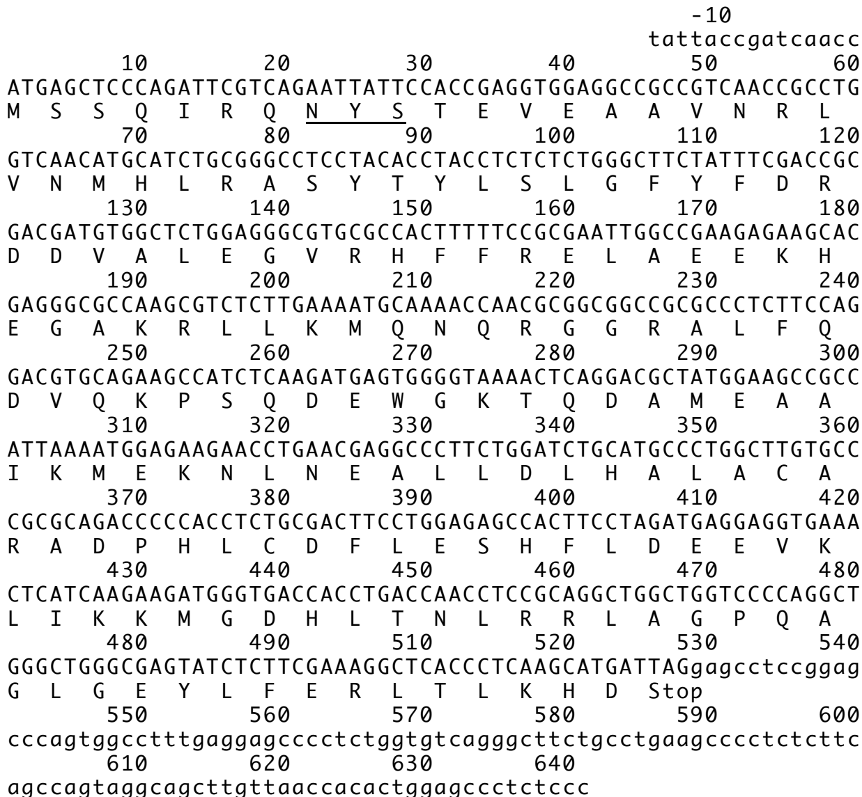
Figure 2 Nucleotide and deduced amino acid sequences of the ferritin L subunit of dolphin ( P. crassidens ) leukocytes. The sequence contains the coding (capital letters) and noncoding (lower-case letters) regions. Amino acids underlined represent the putative glycosylation site. This sequence data has been submitted to the DDBJ/GenBank/EMBL nucleotide sequence database under accession number AB371411 .

tein (excluding the N-terminal methionine), and a 113-bp 3'-untranslated region. Sequences of the L subunit coding regions, including the 5'- and 3'-untranslated regions were determined in P. crassidens , G. griseus , G. macrorhynchus , and T. truncatus of the six different dolphin species. However, the 3'-untranslated region of L. obliquidens , and both the 5'- and 3'-untranslated regions of D. leucas could not be determined because sufficient amounts of PCR product for sequencing could not be produced for unknown rea-