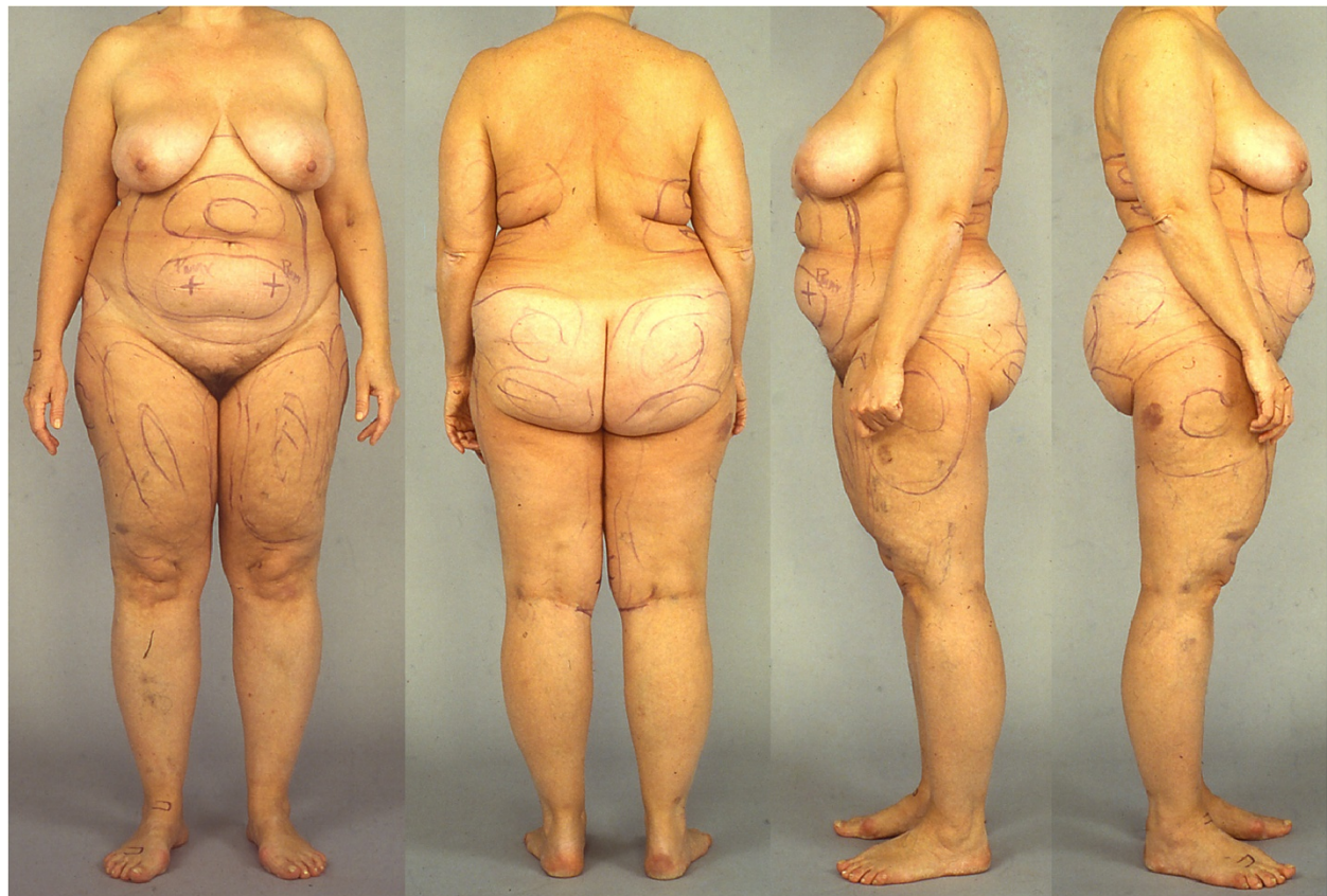
Figure 3 Patient with Dercum's disease. The patient has type I Dercum's disease, a generalised diffuse form encompassing diffusely widespread painful adipose tissue without clear lipomas. The markings are preoperative markings before liposuction. Written informed consent was obtained from the patient for publication of this report and any accompanying images.

subcutaneous adiposity he did not fulfil the criteria for Dercum's disease and it is hence unclear if this condition should be classified as a separate entity. Furthermore, contrary to in Dercum's disease, it was not the fatty masses themselves that were painful, but they caused pressure on other structures and subsequent pain.