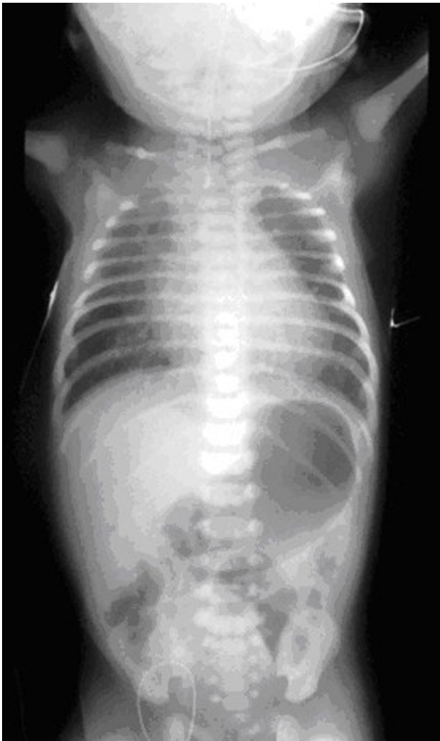
Figure 2 Plain X-ray of the chest and abdomen showing the radio-opaque tube in the blind upper oesophageal pouch. Air in the stomach indicates the presence of a distal tracheoesophageal fistula.

There is an increased incidence of associated anomalies in pure atresia (65%) and a lower incidence in H-type fistula (10%).