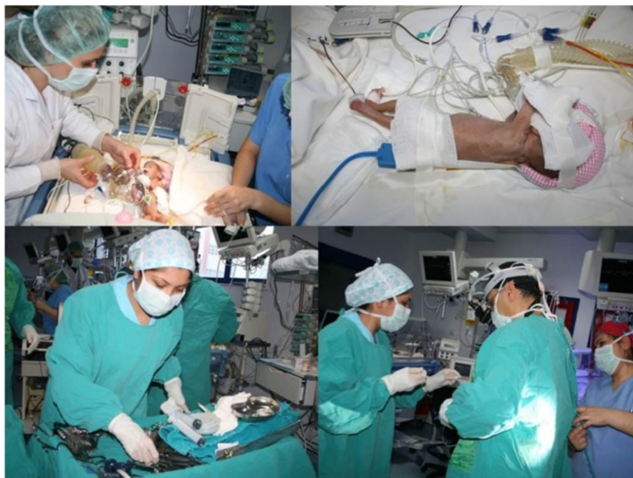
Figure 1 Preparation of the surgical field.

The local ethics committee of Dokuz Eylül University has approved for performing this retrospective study on February 16 th , 2012 (#2012/05-09). Written informed consent was obtained from the parents or relatives of