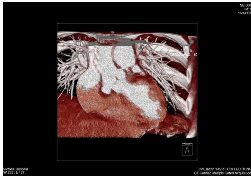
Figure 1 CT scan showing: non coronary cusp aneurysm with intramural thrombus.

the aneurysmal dilatation occurs hidden under the right ventricular outflow tract and the adjacent part of the right atrium Fig (2).