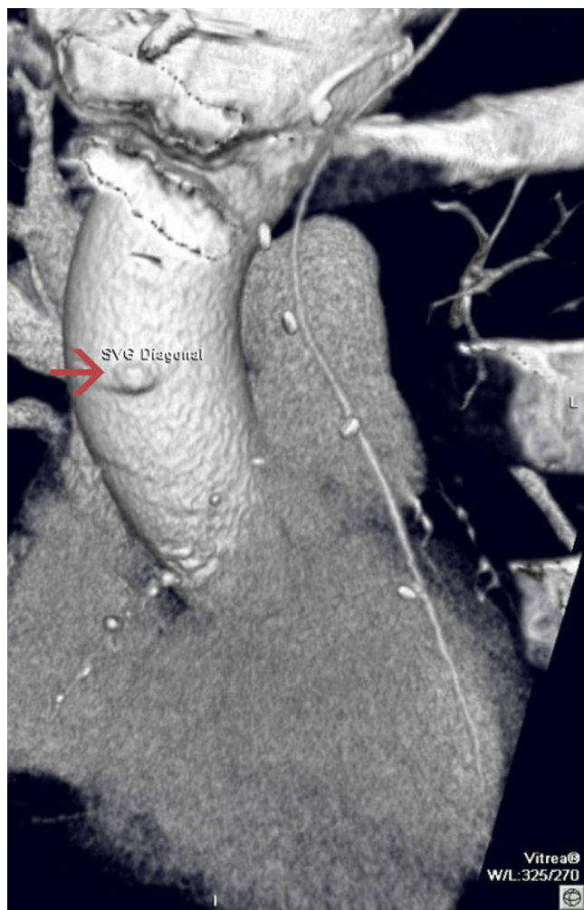
Figure 2 Occluded saphenous vein graft; only graft stump visible (arrow).

Computed tomography was first investigated as a possible method of determining patency of coronary artery bypass grafts in the early 1980s. Gunthner et al[10] found that they were able to determine patency in 77.5% of left anterior descending (LAD) and right coronary artery (RCA) grafts and 40% of obtuse marginal (OM) grafts. Brundage et al[9] also found 95% correlation between single slice CT and conventional angiographic detection of graft patency. With the advent of spiral and MDCT scanners, image quality has improved and, in line with this, interest in minimally invasive imaging techniques has grown. Since these first studies, further larger scale studies have been undertaken to assess the ability of CT to assess graft patency. Recently, Song and colleagues reported that MDCT imaging resulted in 99.4% specificity and 100% sensitivity, with 100% PPV and 80% NPV for detection of bypass graft patency[20]. This study, however, looked at patients (n=50) immediately post-coronary artery bypass operation, who may be expected to have a high patency rate and no graft vasculopathy, thereby minimising any ambiguity caused by poor flow in chronically diseased grafts. Recent studies (n = 25–65) looking specifically at graft patency in study populations similar to the present, have reported sensitivities of 90–98% and specificities of 88–100% for detection of graft patency[11,15,21]. Consistent with our