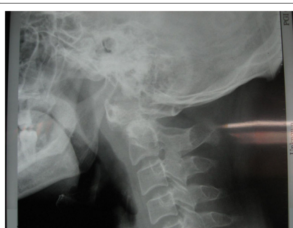
Figure 2 Post reduction film of the same subject using skeletal traction in the ward. Further complete reduction was obtained intraoperatively using skeletal traction with crutchfield tongs.

vertebral artery on Computed Tomography Scan were also excluded from the study. This was studied using axial and saggital cuts of the CT scan in the region of transverse foramen of the C2 vertebra. High riding vertebral artery was identified as having a too medial and/