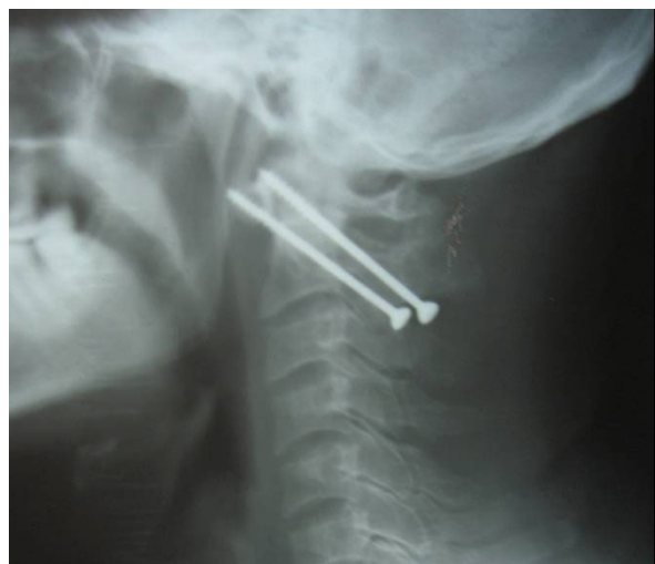
Figure 4 Postoperative radiograph of the subject showing placement of two transarticular screws across the reduced atlantoaxial joints.

Postoperative radiographs showed adequate reduction of C1 over C2 in 35 cases. Adequate screw placement was seen in 31 cases (figure 4 & 5). In one patient only one screw could be placed due to vertebral artery injury on that side. Another subject had screw cutout. She was a case of rheumatoid arthritis, and was taking steroids for a long period. Radiographs were suggestive of markedly reduced bone density. She did not progressed to union, and neurological deficit persisted in her. In the third patient the screw placement was a little too lateral and superior, and the screws penetrated out of the anterior cortex of the anterior arch of C1. The future course