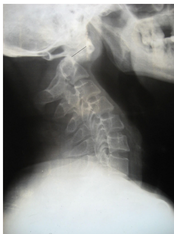
Figure 1 Lateral radiograph of a subject with atlantoaxial instability secondary to odontoid fracture showing marked atlantoaxial displacement.

Subjects who had pathology of the C1-C2 facets and C1 lateral masses, such as comminuted fractures or the tumors destroying the C1 lateral masses that preclude screw placement were excluded from the study. Subjects who were found to have anomalous course of the