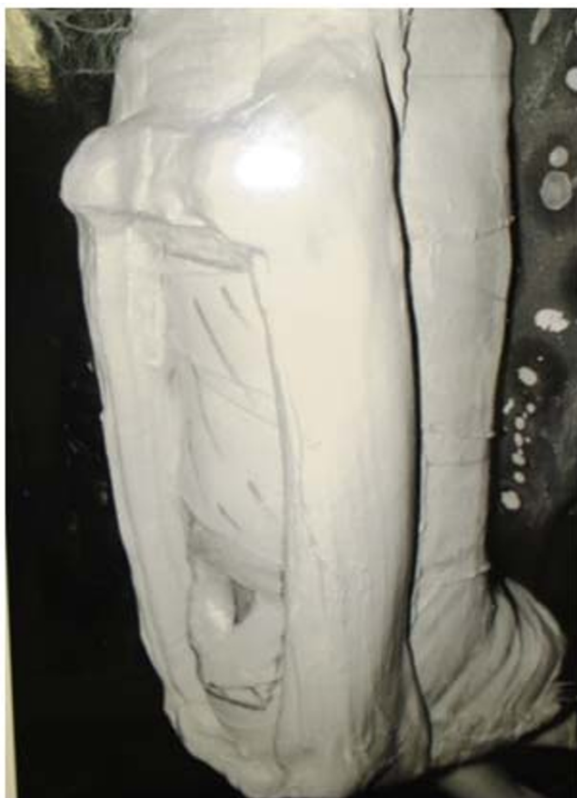
Figure 1 POP boot. A 'modified plaster of paris boot' is designed to make sure that there is no pressure on the flap pedicle even if the patient is lying supine in bed. One can appreciate the built in walls of the boot on the posterior aspect, with the flap visible from within them.