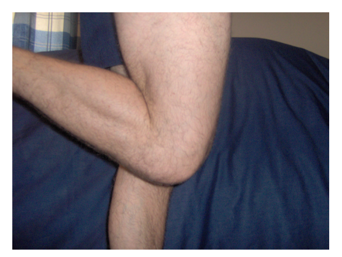
Figure 8 Improved flexion 2 weeks post-operatively.

[16,11,17,12]. However, none of these patients played sport. Reporting on five cases, Narvekar et al concluded that because none of the patients participated in any type of sporting activity, the thinned ACL mass probably sufficed to provide the requisite stability for day-to-day activities [17]. Nishimori et al concluded that if their patients had participated in any type of sport, they might have had to consider augmentation or reconstruction of the ACL after resection of the lesion [12].