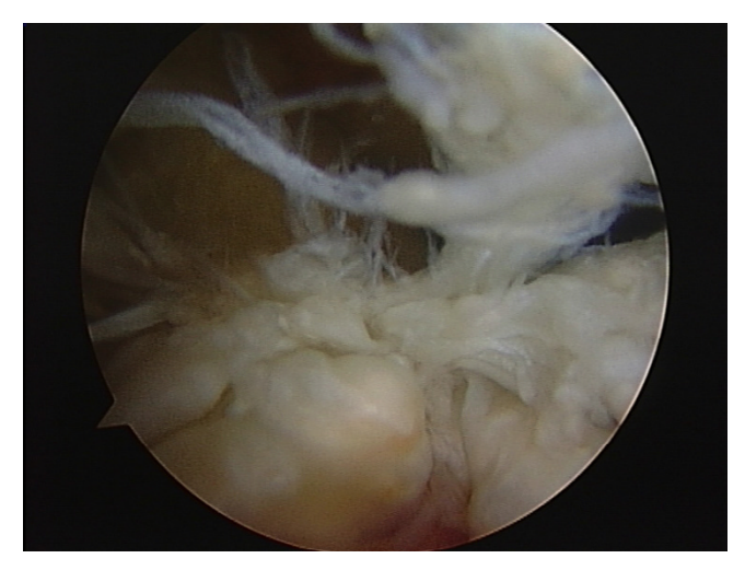
Figure 9 Torn ACL prior to reconstructive surgery.

Only one previous case of an athlete is reported; Fealy et al describe a successful return to sport following arthroscopic debridement of the ACL of a volleyball player [16].