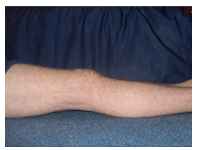
Figure 6 Improved extension 2 weeks post-operatively.

cases in the literature describe ganglia formation in the absence of trauma. However, excessive training or repetitive minor trauma such as rugby tackles could well be a triggering factor [8,7,10,12]. Although repetitive trauma from rugby may be a contributing factor, the aetiology of the current case is not known and there are no known hereditary factors in the history.