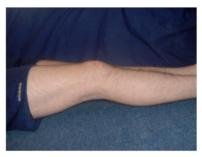
Figure 5 Reduced extension of the right leg prior to surgery.

unproven. Bergin et al. reported that ACL ganglia and mucoid degeneration commonly coexist and gave some evidence to suggest these two entities may share a similar pathogenesis [5]. Another theory suggests that herniation of synovial tissue through a defect in the tendon sheath causes ganglia formation [15]. A third describes displacement of synovial tissue during embryogenesis [3]. The relationship to trauma is unknown. One theory involves the cellular response to trauma that liberates a mucin substance, hyaluronic acid. This is interspersed with the fibres of the ligament, causing its fusiform dilatation. With joint and tissue motion, the mucin substance dissects the ligament fibers and may be found at the ligament attachments or in the intercondylar notch of the knee [9]. Many