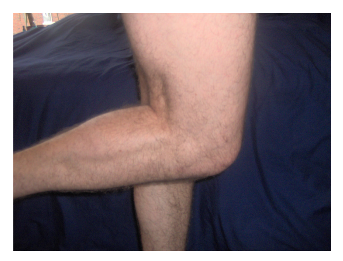
Figure 7 Reduced flexion of the right leg prior to surgery.

There are no reported cases of ACL rupture following pathogenesis of this type. The literature shows that arthroscopic debridement of the abnormal tissue effectively relieves symptoms [16,3,6,17,13,18,19]. However, this inevitably results in a thinned ACL, which could compromise joint stability. Cases in the literature report no instability in day-to-day activities following debridement