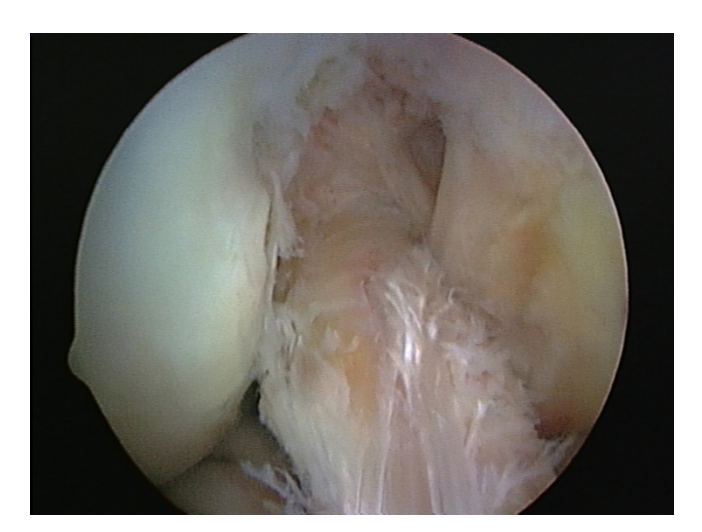
Figure 4 Improved position of ACL following excision of the diseased tissue.

unproven. Bergin et al. reported that ACL ganglia and mucoid degeneration commonly coexist and gave some evidence to suggest these two entities may share a similar pathogenesis [5]. Another theory suggests that herniation of synovial tissue through a defect in the tendon sheath causes ganglia formation [15]. A third describes displacement of synovial tissue during embryogenesis [3]. The relationship to trauma is unknown. One theory involves the cellular response to trauma that liberates a mucin substance, hyaluronic acid. This is interspersed with the fibres of the ligament, causing its fusiform dilatation. With joint and tissue motion, the mucin substance dissects the ligament fibers and may be found at the ligament attachments or in the intercondylar notch of the knee [9]. Many