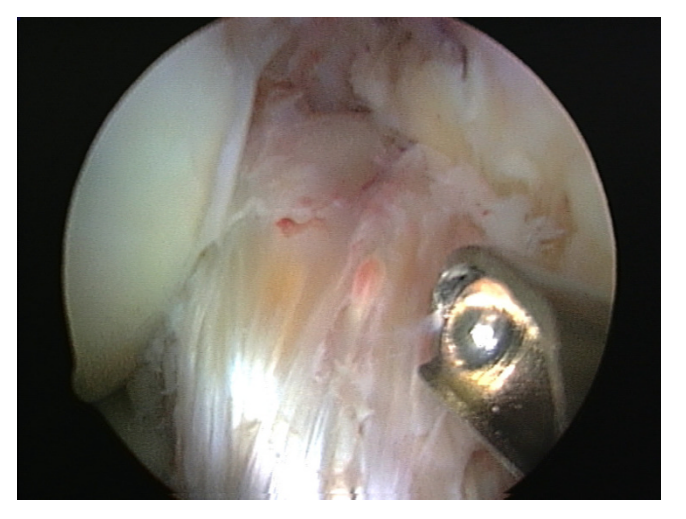
Figure 2 Abnormal tissue displacing the ACL anteriorly out of the notch.

Figure I A sagittal T2-weighted MRI showing thickening and pathological appearance of the ACL.