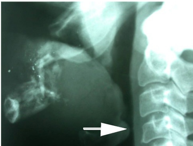
Figure 4 Male patient who sustained high velocity injury to the lower face. Tracheostomy was performed in the Shock-Trauma Unit. Lateral x-ray shows comminuted fracture of the mandible with huge soft tissue swelling of the neck and narrowing of the airway (white arrow).

GlideScope is a video laryngoscope which enables indirect visualization of the epiglottis. Like many other indirect fiberoptic and video-based instruments, it was developed as a potential alternative to direct laryngoscopy for cases involving difficult intubation [29].