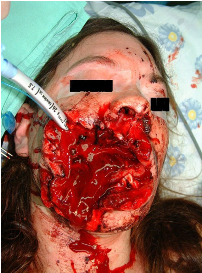
Figure 1 A woman who sustained a single gunshot injury. She arrived at the hospital conscious and breathing spontaneously. Impossible mask ventilation and difficult intubation were anticipated. Direct laryngoscopy was performed and oro-tracheal intubation was successful.

ing to the patient's injuries, airway status and the care provider's experience with such equipment and procedures.