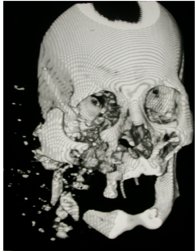
Figure 2 A patient with high velocity long distance injury, with severe soft tissue damage of the right chick. 3 dimensions CT shows comminuted fracture of the right orbit, zygoma and right mandible.

As stated earlier, the challenge in performing endo-tracheal intubation arises mainly from the difficulty in visualizing the vocal cords. Numerous airway devices and equipment have been developed to overcome this obstacle [27]. Some, such as the fiberoptic bronchoscope, enable indirect visualization of the vocal cords. Others, such as the laryngeal mask airway (LMA) or Combitube (esophageal-tracheal twin-lumen airway device), are inserted blindly and do not require visualization of the vocal cords by any means [28]. The final option is creating a surgical airway via cricithyrotomy or tracheotomy, thus bypassing the larynx and establishing direct access to the trachea.