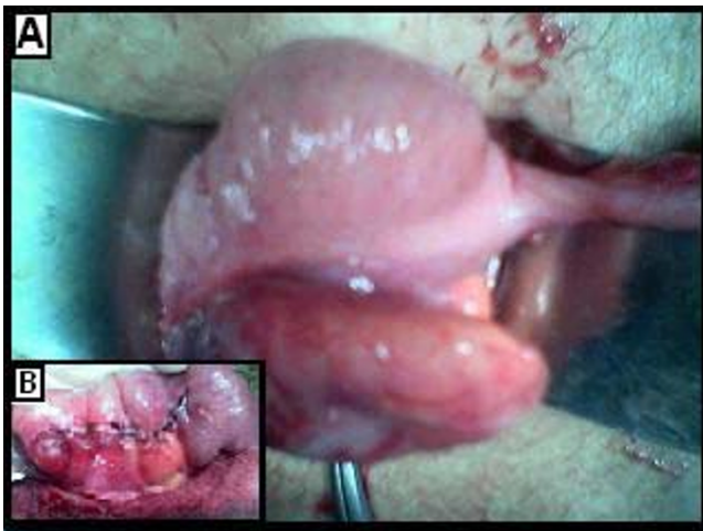
Figure 1 A: Intraoperative view. B: Postoperative view.