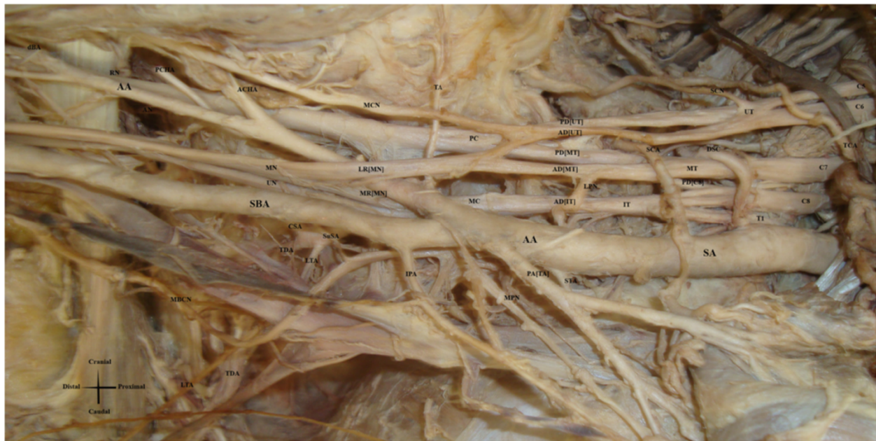
Figure 2 Cadaveric photo of variation of brachial plexus and axillary artery variations. UT: Upper trunk; MT: Medial Trunk; IT: Inferior Trunk; AD [UT]: Anterior division of Upper Trunk; AD [MT]: Anterior division of Middle Trunk; AD [IT]: Anterior division of Inferior Trunk; PD [UT]: Posterior division of Upper Trunk; PD [MT]: Posterior division of Middle Trunk; PD [C8]: Posterior division of C8; MC: Medial Cord; PC: Posterior cord; MR [MN]: Middle root of median nerve; LR [MN]: Lateral root of median nerve; MCN: Musculocutaneous Nerve; MN: Median Nerve; UN: Ulnar Nerve; RN: Radial Nerve; AN: Axillary Nerve; SCN: Suprascapular Nerve; MBCN: Medial Brachial Cutaneous Nerve; LPN: Lateral pectoral nerve; MPN: Medial Pectoral Nerve; SA: Subclavian Artery; SCA: Suprascapular Artery; DSC: Deep Scapular Artery; AA: Axillary Artery; SBA: Superficial Brachial Artery; dBA: Deep Brachial Artery; DSC: Deep Scapular Artery; TCA: Transverse Cervical Artery; STA: Superior Thoracic Artery; TA: Thoracoacromial Artery; PA [TA] Pectoral Branch of Thoracoacromial Artery; SuSA: Subscapular Artery; LTA: Lateral Thoracic Artery; TDA: Thoracodorsal Artery; CSA: Circumflex Scapular Artery; IPA: Inferior Pectoral Artery; ACHA: Anterior Circumflex Humeral Artery; PCHA: Posterior Circumflex Humeral Artery.