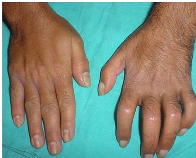
Figure 1 Typical features of CRPS. Note the hypertrichosis, edema, joint stiffness nail changes, skin atrophy, mirror image changes in opposite hand.

adjuvant were tried unsuccessfully. In the 10 th week, a trial of SGB with 10 mg Ketamine as an adjuvant was given after informed consent and midazolam premedication. He experienced 'light headedness', described as a pleasant floating sensation and reported dynamic VAS score to be 1. The pain relief lasted for 36 hrs. Thereafter, he received 3 days of continuous stellate ganglion infusion [0.0625% Bupivacaine with 0.5 mg Ketamine/day] @ 2 ml/hr. The improvement was rapid, VAS [static] remained 0, dynamic VAS [1,2], with reduction in the intensity of heat and mechanical allodynia [1–2/10]. Weight bearing physio-