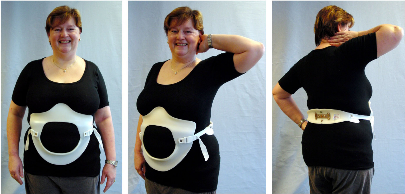
Figure 4 physio-logic® brace. physio-logic® brace improving chronic low back pain in this patient with spinal stenosis and increasing walking ability drastically from 500 steps to 12000 steps.