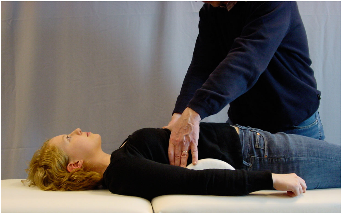
Figure 2 The Sagittal Realignment Test (SRT). Sagittal realignment test (SRT) lying (Weiss 2005) to estimate as to whether a patient will benefit from physio-logic® exercises or the physio-logic® brace. In the positive case this test will immediately reduce chronic LBP (PLBP).

117 patients reported significant pain release in the SRT and 13 in the SDT ( \geq 2 steps in the Roland & Morris VRS). 3 Patients had no significant pain release in both of the tests ( < 2 steps in the Roland & Morris VRS). In the 16 patients who did not respond to the SRT in the manual