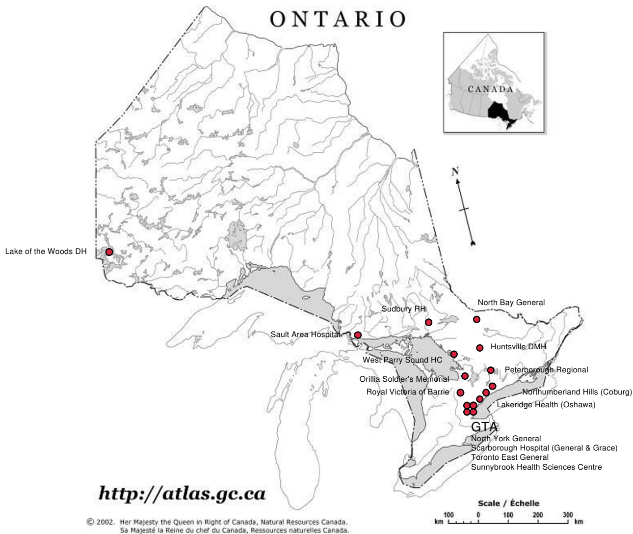
Figure 1 Map showing geographic distribution of hospitals involved in the study network. Map of Province of Ontario showing geographic locations of participating sites. Abbreviations: DH = District Hospital; RH = Regional Hospital; DMH = District Memorial Hospital; HC = Health Centre; GTA = Greater Toronto Area.

eligible); 6) and prevention of decubitus (pressure) ulcers (very to extremely relevant 93%; 68% of patients eligible).