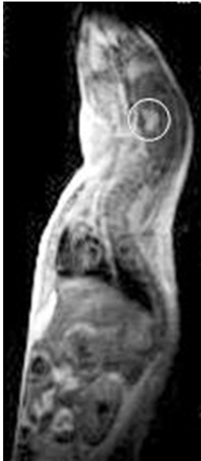
Figure 1 Magnetic Resonance Image of a HMGA2 transgenic mouse showing a pituitary adenoma (indicated in circle).

pRB controls cell cycle progression through its interaction with the E2F family of transcription factors [26,27], whose activity is crucial for the expression of several genes required to enter the S phase of the cell cycle [28,29]. The transcriptional activity of E2F1 is repressed in non-proliferating cells by its interaction with pRB that masks the activation domain of E2F1, and prevents it to contact the