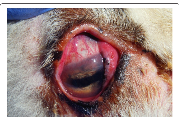
Figure 2 One of the more severe IKC cases observed during the study period, eye of a domestic sheep from the Pyrenees showing epiphora, conjunctival hyperemia, peripheral corneal edema, and neovascularization.

sampling periods (Table 1) indicate that M. conjunctivae infection is widespread among domestic sheep in the Pyrenees, endemic and self-maintained within domestic sheep flocks. This agrees with previous data on M. conjunctivae prevalence (25.8%) in domestic small ruminants from Central Pyrenees [12] and the wide distribution of M. conjunctivae infection in domestic sheep throughout Europe [4,7]. In contrast, the lower prevalence found in the Cantabrian Mountains and the fact that M. conjunctivae was detected in only one flock in this region suggest that M. conjunctivae is currently less common in this area. Moreover, the only M. conjunctivaepositive flock in the Cantabrian Mountains seasonally migrates to Caceres (South-Western Spain) in winter. Hence, the origin of M. conjunctivae in this flock is unclear and could lead to an overestimation of the endemic situation of M. conjunctivae in this region. Furthermore, the occurrence of M. conjunctivae relative to IKC cases in the two study areas strongly differed. Whereas there is a good agreement between IKC cases and the presence of M. conjunctivae in the Pyrenees, this is not the case in the Cantabrian Mountains.