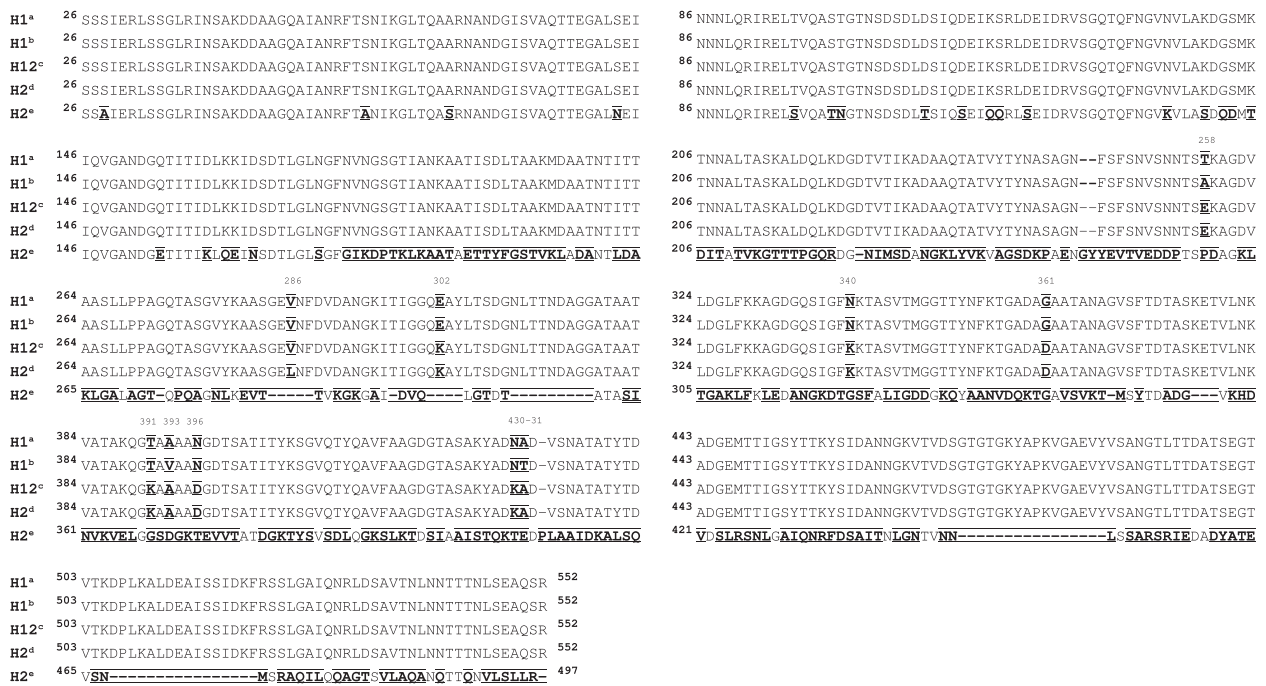
Figure 2 Multiple-sequence alignment of flagellin amino acid sequences representing serogroups H1, H2 and H12 of E. coli using Clustal W. The amino acid sequence of H1 a was obtained in this study [GenBank: KC753181]. The amino acid sequences of serogroups H1 b , H12 c , H2 d and H2 e were retrieved from NCBI protein database [GenBank: ADR27342, AAQ22679, AAD28525 and BA130971, respectively]. Two very distinctive H2 flagellin sequences were included in the alignment (H2 d : common H2 sequence; H2 e : peculiar H2 sequence obtained from E74/68). A dash (-) denotes a gap in the alignment. Amino acid sequence differences are indicated in bold letters. Numbers indicate the various amino acid sequence positions.

isolates were obtained from the same farm and 2 of them were isolated from the same animal but from different swab samples. The remaining 2 isolates were isolated from 2 different farms in Penang and showed unrelated pulsotypes (more than 3 band differences). REP-PCR profiling also revealed only 3 distinct patterns with one REP profile found for each farm (Figure 1). Isolates that shared the same pulsotype (A1) had the same REP profile (B1). All 5 isolates with the same serotype shared an indistinguishable pulsotype and REP profile while another two were genetically different.