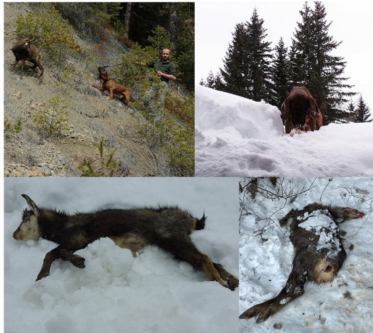
Figure 3 Photos showing the handler and the trained disease-detector dogs in the field, and a number of Alpine chamois carcasses collected from under the snow cover. The handler, Roberto Permunian, is consented to the use of his image for publication purposes.

spring compared with the other seasons [25]. Interestingly, the regular use of dogs showed that occurrence of mange is not as concentrated in winter and early spring as observations from distance to detect scabietic chamois would suggest [25].