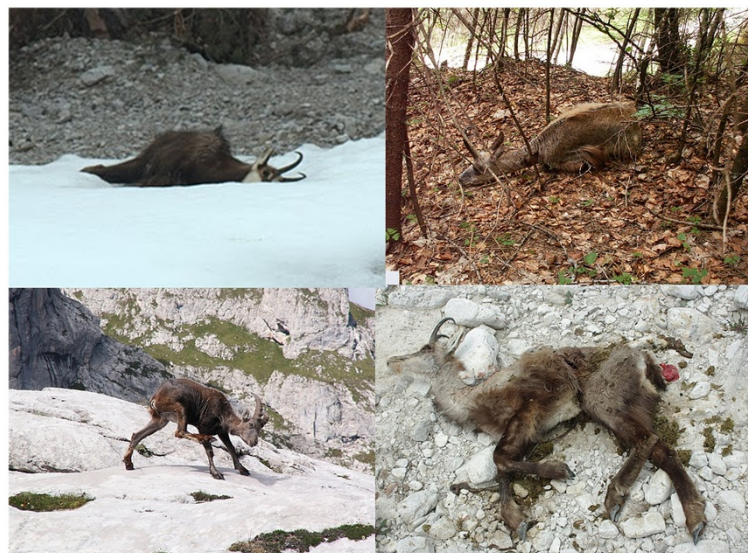
Figure 1 Photos of decomposed carcasses, and sick Alpine chamois and Alpine ibex showing mangy lesions.

At that time of the index case, conservative census data by direct observation indicated that the local chamois population, for which yearly census data by direct observation were available, was numbering 810 heads (6.0 chamois/100 ha). In the following years, a significant demographic decline (with peak mortality in years in 1997, 1998 and 2001) was observed, leading to a low post-epidemic density of 1.4 heads/100 ha and a conservative decline estimate of 77% (Figure 1). The first epidemic wave of scabies waned during years 2003 to 2007,