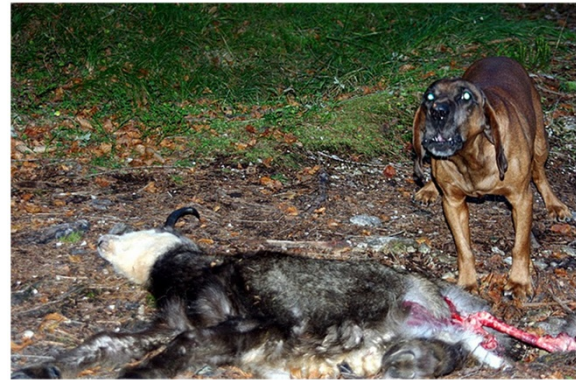
Figure 2 Photo of laboratory-like conditions, showing the trained dogs with the carcasses of mangy Alpine chamois.

The same training scheme, with the only deviation that mangy carcasses were used for “true” trails and mange-free carcasses for “false” trails, was used to accustom Ingo to the exclusive search of infected animals. At first, Ingo barked whenever he found a carcass (mangy or mangy-free), but he was only rewarded when successful in localizing a mangy carcass. Additional training was carried out with mangy carcasses only. A mange-infected carcass was located in a known place, ~300 m far from the dog (in some cases under snow or in the dense forest). The dog was trained to search and locate the mangy carcass, and he was taught to approach to mangy carcass’s pulling away point (the nearest point to pull away the carcass from the snow). By the end of the specific training phase, Ingo had learned to seek out only the mangy carcasses, even under the snow cover. His ability to track and stop the living mangy chamois was similar to his original work to recover wounded animals in a hunt context, but in this case mangy animals were the “targets” and healthy ones the “false” (Figure 2). Ingo had 3–4 training sessions each week for approximately 6 months. The training session took between 5 minutes, when carcasses were near to the street or they were approximately localized by forest