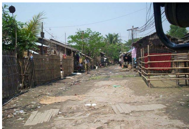
Figure 2 Peri-urban street in Myanmar (Burma).

In her case-study of breastfeeding in Vietnam, Morrow argued that poverty actually threatens breastfeeding, both directly and indirectly [16]. For financial reasons, many women are required to return to work soon after child-