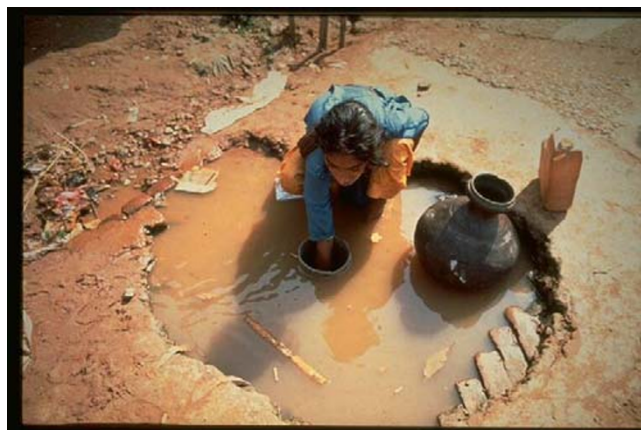
Figure 1 A woman collecting water in rural West Bengal, India.

to infant health and wellbeing; Figures 1, 2, 3 are illustrations of living conditions in Africa and Asia.