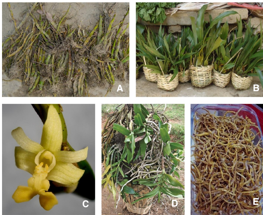
Figure 2 Trade in illegally collected medicinal orchids in Nepal. 2A. Dendrobium eriiflorum (photograph: B. Kunwar). 2B. Coelogyne species in market outlets (photograph: A. Subedi). 2C. Flickingeria fugax (photograph: A. Subedi). 2D. Aerides and Dendrobium species in traditional bamboo baskets (photograph: B.B. Raskoti). 2E. Dendrobium eriiflorum originating from Nepal in Hong Kong supermarkets (photograph: Anonymous).

Dakshinkali, 22 km from Kathmandu, is the center of wild orchid trade in Nepal, and orchids have been sold for over 25 years. Dakshinkali has at least 10 vendors that are