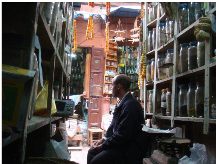
Figure 3 Herbalist's store in the Marrakech herbal market.

market chain to various collection sites in rural areas surrounding Marrakech. Twenty three collectors were identified and voucher specimens were collected with them during their normal collecting activities. Specimens matching local names were collected in each of the sites where collection was taking place (one or more specimens for each vernacular name). Botanical identification of plants was done by Abderrahim Ouarghidi, under the supervision of Dr Mohamed Ibn Tattou and Dr Mohamed Fennane from the Scientific Institute of Rabat (ISR). Collected vouchers were compared with specimens in the Herbarium of ISR. Flore de L'Afrique du Nord [9]