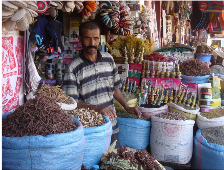
Figure 2 Bags containing single medicinal roots and herbal mixtures in the Marrakech herbal market.