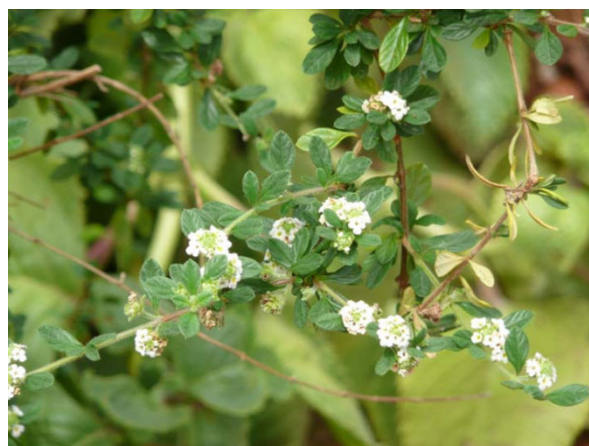
Figure 3 Close-up view of Dominican ti dité , Lippia micromera Schauer.

African and American tropical peoples most usually use Lippia species to treat respiratory disorders [80], for stomach problems and as sedatives ([80] and [84] for review of L. alba in South America). For example, Jamaicans use L. alba for insomnia [5], and Brazilians use L. alba and L. geminata as sedatives [85,86], and