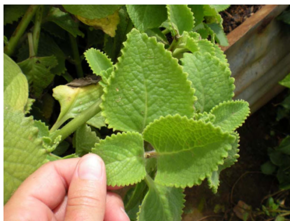
Figure 5 Close-up view of Dominican go dité , Plectranthus [Coleus] amboinicus [Loureiro] Sprengel.

The third most salient treatment for fright is Plectranthus [Coleus] amboinicus [Loureiro] Sprengel (Lamiaceae), which Dominicans call go dité and go djai , whether speaking English or French Creole (figure 5). (The species is widely used in tropical regions and outside of Dominica has numerous English common names including Cuban oregano, Mexican mint, Indian borage, Spanish thyme, and French thyme.) In freelists, Dominicans listed go dite/go djai one time more than ti dité (38 mentions, or 46% of informants), however these mentions fell further toward the ends of individuals' freelists making the plant slightly less salient statistically ( go dité ( P. amboinicus ) silence score is .31 and ti dité ( L. micromera ) has a .39, a 7.9% difference). Plectranthus amboinicus is a native of the East Indies that has become