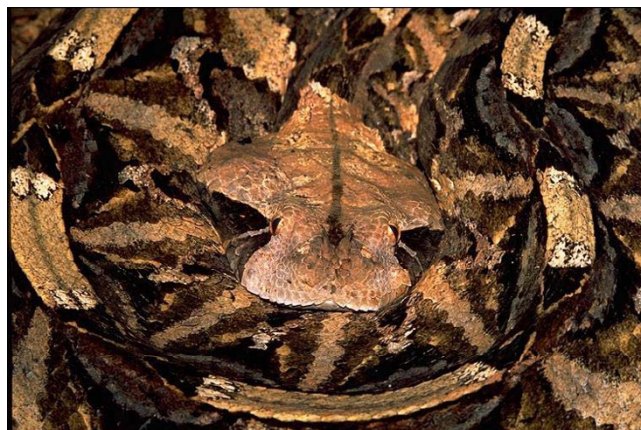
Figure 3 Bitis gabonica .

Snakes are called 'nzoka' and 'thuol' in the Kamba and Luo language respectively. In Kambaland, a number of venomous species were identified: "nzoka ya kiko" or Naja melanoleuca (Fig. 2); the very fierce "yaitha" or Dendroaspis polylepis and 'kimbuwa' or Bitis spp. (Fig. 3) the puff adders. With exception of the spitting cobra, these snakes typically deliver venom through two hollow teeth called fangs; the venom is called 'kiri' in Dholuo and "sumu" in Kikamba . Spitting cobras are notable for visiting settled areas and are reputed to spit venom toward enemies up to 2.5 m away. There was concurrence among the informants that some snake bite cases were caused by malevolent persons.