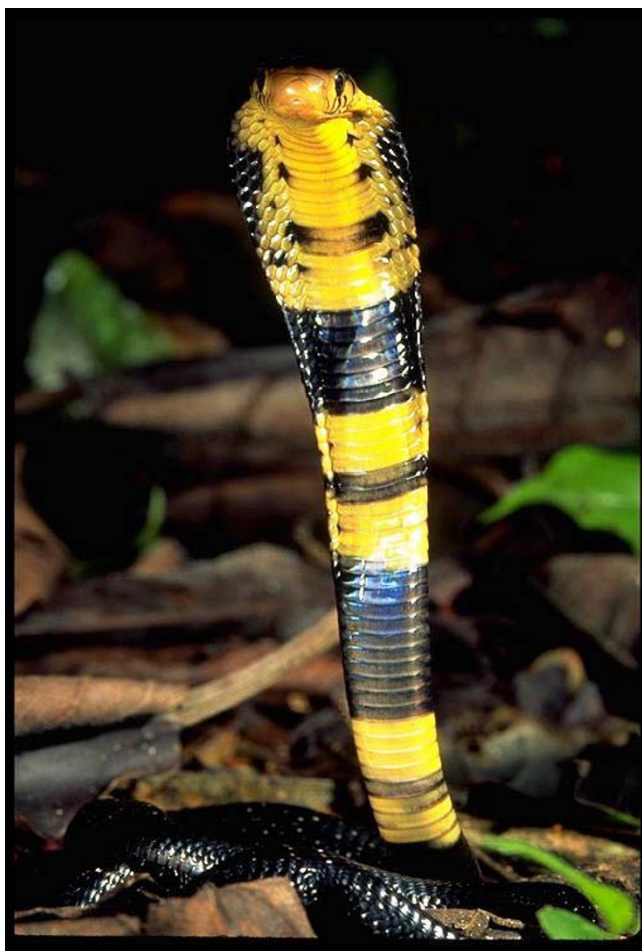
Figure 2 Naja melanoleuca.

education. The information in table 1 is for the total 212 respondents interviewed. In general the more educated respondents had less knowledge on these remedies.