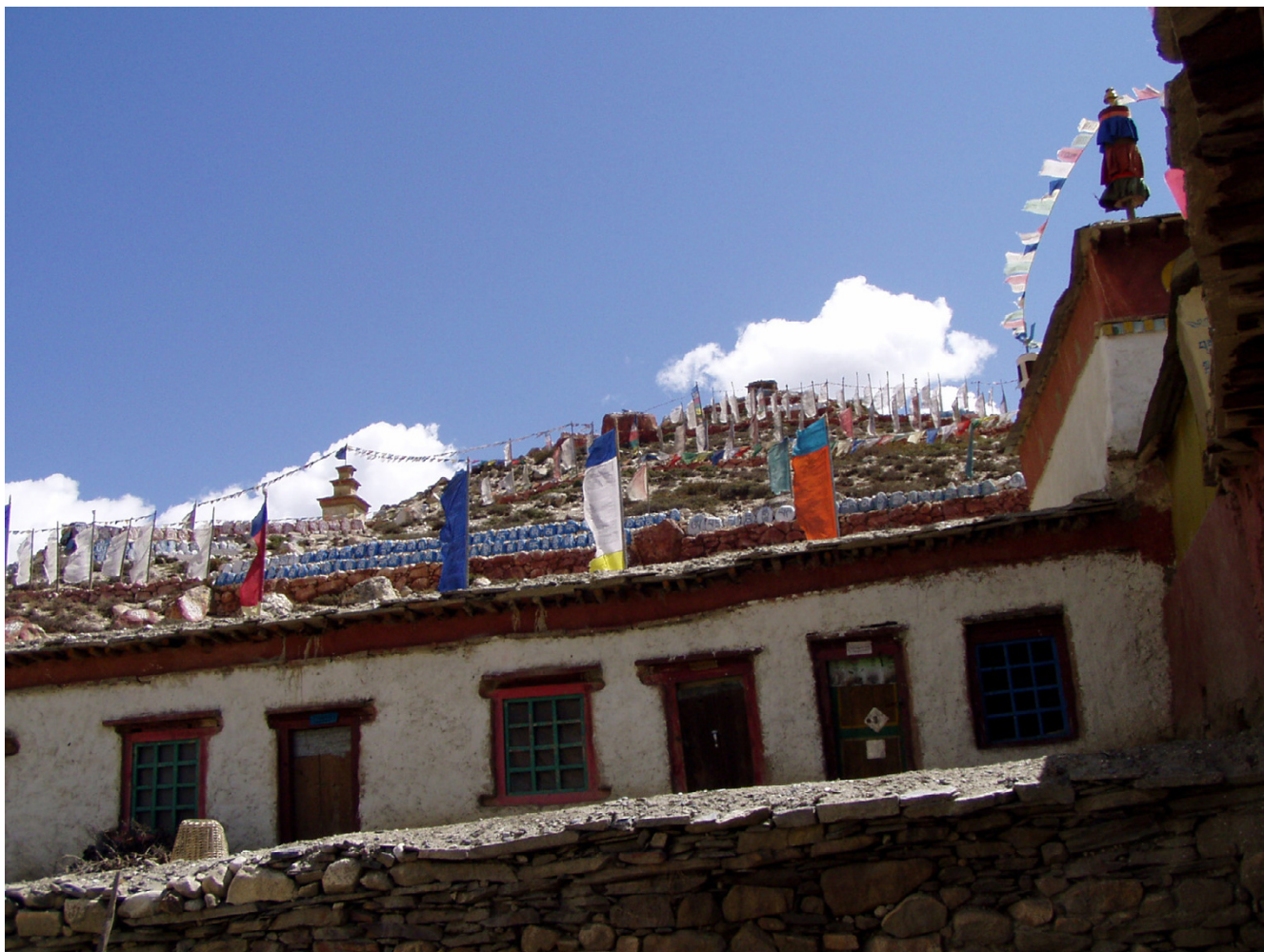
Figure 2 Monastery of Phoo

used for cough and cold, chest pain, stomachache, diarrhoea, dysentery, worms, rheumatism and gastritis and Hippophae tibetana fruit is used as a diuretic, tonic, cough and cold, to treat periods of weakness, and worms. These two species are used to treat broad range of ailments. It is very important to take immediate steps towards conservation and management aspects of these two important medicinal plants of Manang. Cultivation of these two species in the barren lands helps in conservation and management, while at the same time can improve the economic status of poorer people. Several development projects use fruits to make a now popular juice in the districts of Manang and Mustang, commonly called 'Sea-buckthorn juice'.