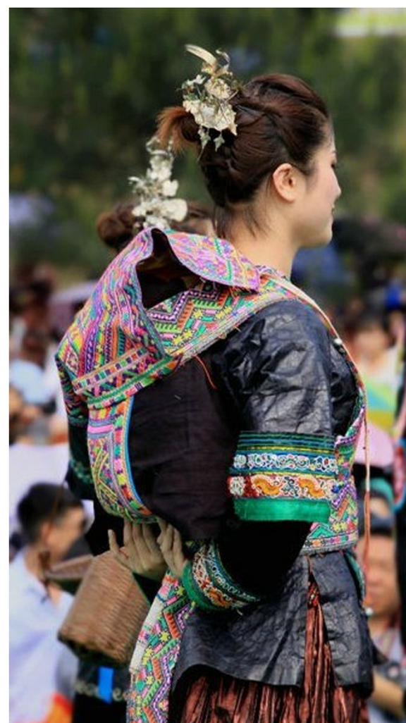
Figure 4 Little Dong girls wearing clothes dyed by plants.

Several of the documented species are recognized for their medicinal value in China. For example, Polygonum tinctorium is a species used as traditional Chinese medicine to clear heat and relieve toxicity, cool blood, mainly for curing mumps, decreasing swelling, and relieve pain and itching [9]. Strobilanthes cusia is used for its anti-influenza viral activity [10] and to clear heat, relieve toxicity, cool blood, relieve sore throat, kill pathogenic microorganisms and improve immunity [9]. Buddleja officinalis is a medicinal beverage recorded in Chinese Pharmacopoeia [11] that is sometimes consumed instead of tea in Yunnan Province with a cool and refreshing taste as well as honey fragrance [12]. It is used clinically as a medicine for treating dry eyes caused by liver vacuity, blurred vision and cataracts. It has also shown to have anti-inflammatory and blood glucose-reducing activity and has the ability to strengthen immunity [13-15]. Buddleja lindleyana has