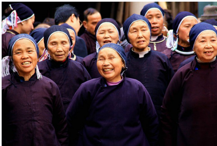
Figure 3 Dong women wearing clothes dyed by plants.

dye is ready which will be indicated by the desired color. The dye is then filtered and utilized. Different glossiness can be obtained by utilizing various materials such as wine and ash.