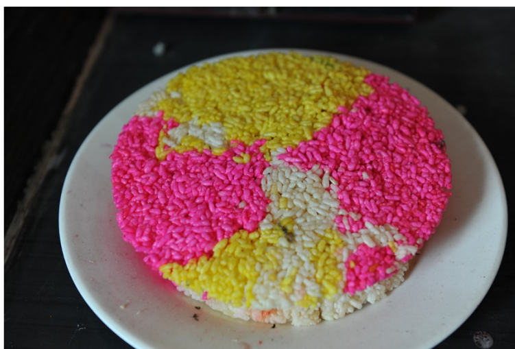
Figure 1 Sticky rice cake dyed by plants in Dong community.

In addition to adding color to foods, informants perceive that many of their dye plants enhance the edible, medicinal and nutritive value of their food well as impart natural preservatives. For example, the yellow pigment derived from Buddleja lindleyana Fortune is locally valued for its medicinal properties including anti-inflammatory, analgesic, calming and liver protecting.