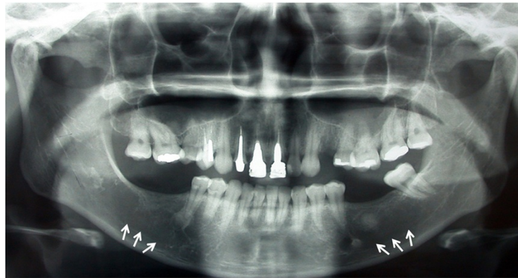
Figure 1 Panoramic radiography demonstrating ill-defined radiolucent areas located bilaterally in the molar edentulous regions (white arrows).